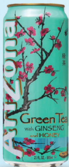
GREEN TEA W/GNSG + HNY 680 ml R 19.54 each, vat excl 61300871526 288330 1x24