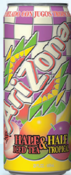
HALF & HALF TROPICAL 680 ml R 19.54 each, vat excl 61300872583 308303 1x24