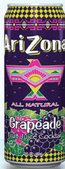
GRAPE 680 ml R 19.54 each, vat excl 61300871929 296521 1x24